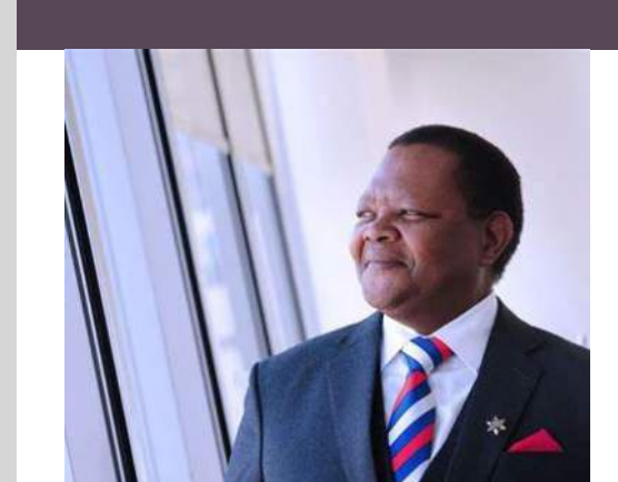
Eskom chair confident power utility will be profitable soon

The power utility is expected to hit a record six months without load-shedding. Eskom is well on its way to recovery, with board chairperson Mteto Nyati, predicting it won't be long before the power utility is able to operate without bailouts from government. Minister will no constraints at keep future en open and fair